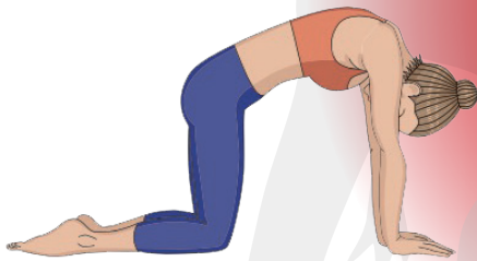
3. Cat and Cow Pose