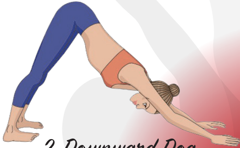
2. Downward Dog